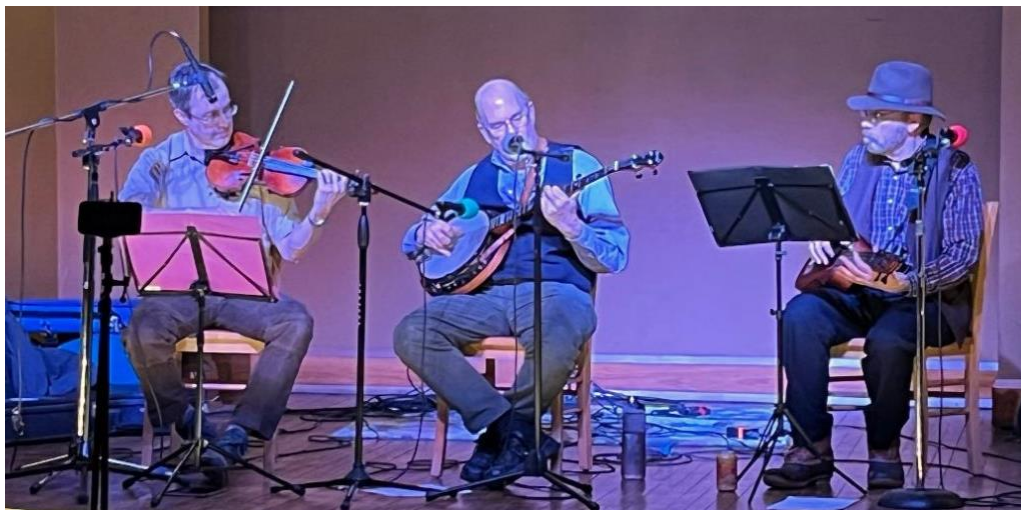
The Eclectics performed in the Roots Cellar Dec. 3.